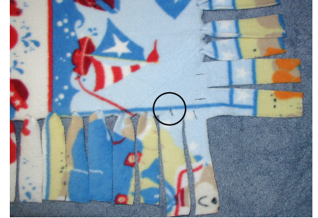
Visit us at: www.projectlinus.org

© 2006-2020 Project Linus National Headquarters All Rights Reserved